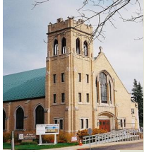
St. Luke's Lutheran Church

The Member Care Cabinet would like to provide dinner for your family. This could be while you are in the hospital or recovering from an illness.